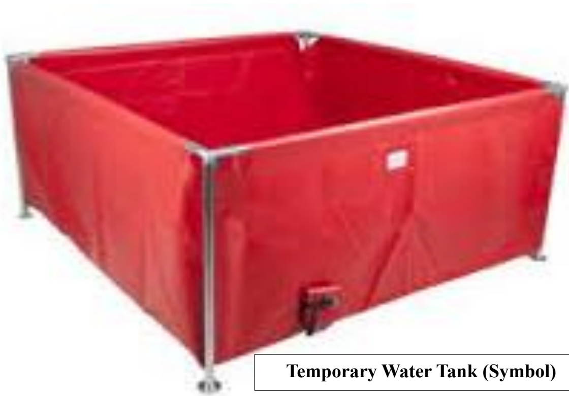
Temporary Water Tank (Symbol)